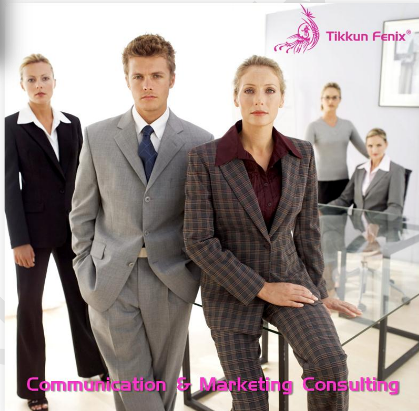
Communication & Marketing Consulting

Sponsoring Business Coaching Business and Managerial Coaching Online Brand Reputation Business Development In Marketing & Communication